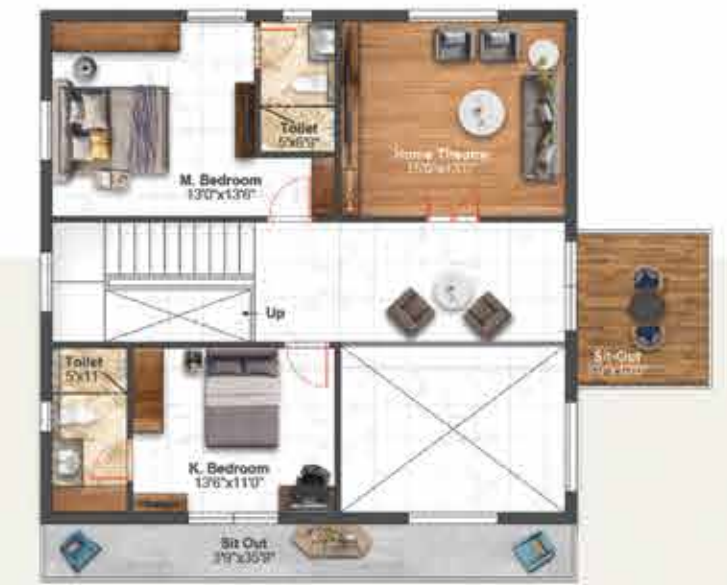
EAST FACING VILLA - G+1