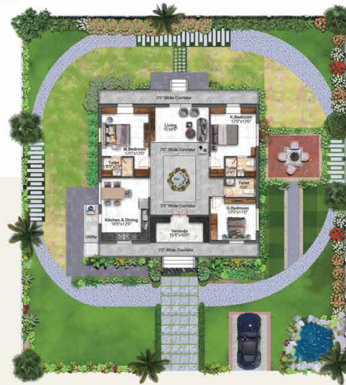
EAST FACING - 3 BHK