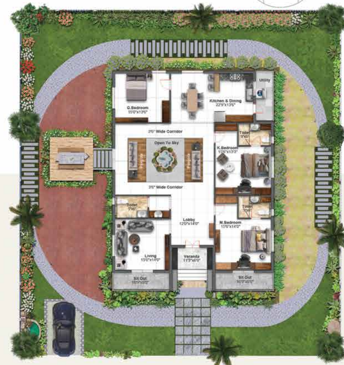
WEST FACING - 3 BHK