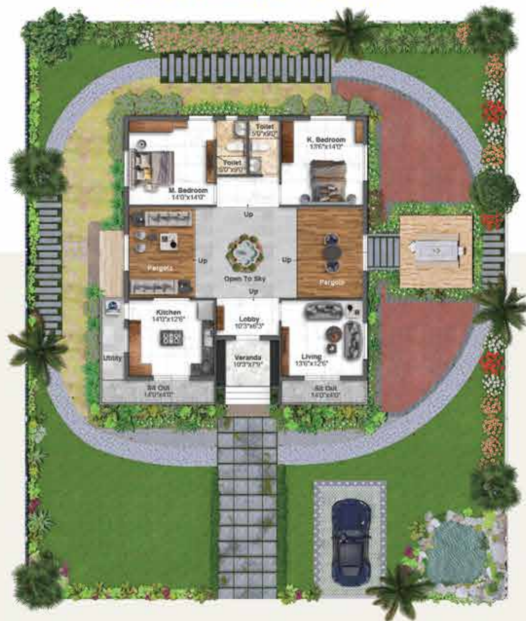
EAST FACING - 2 BHK