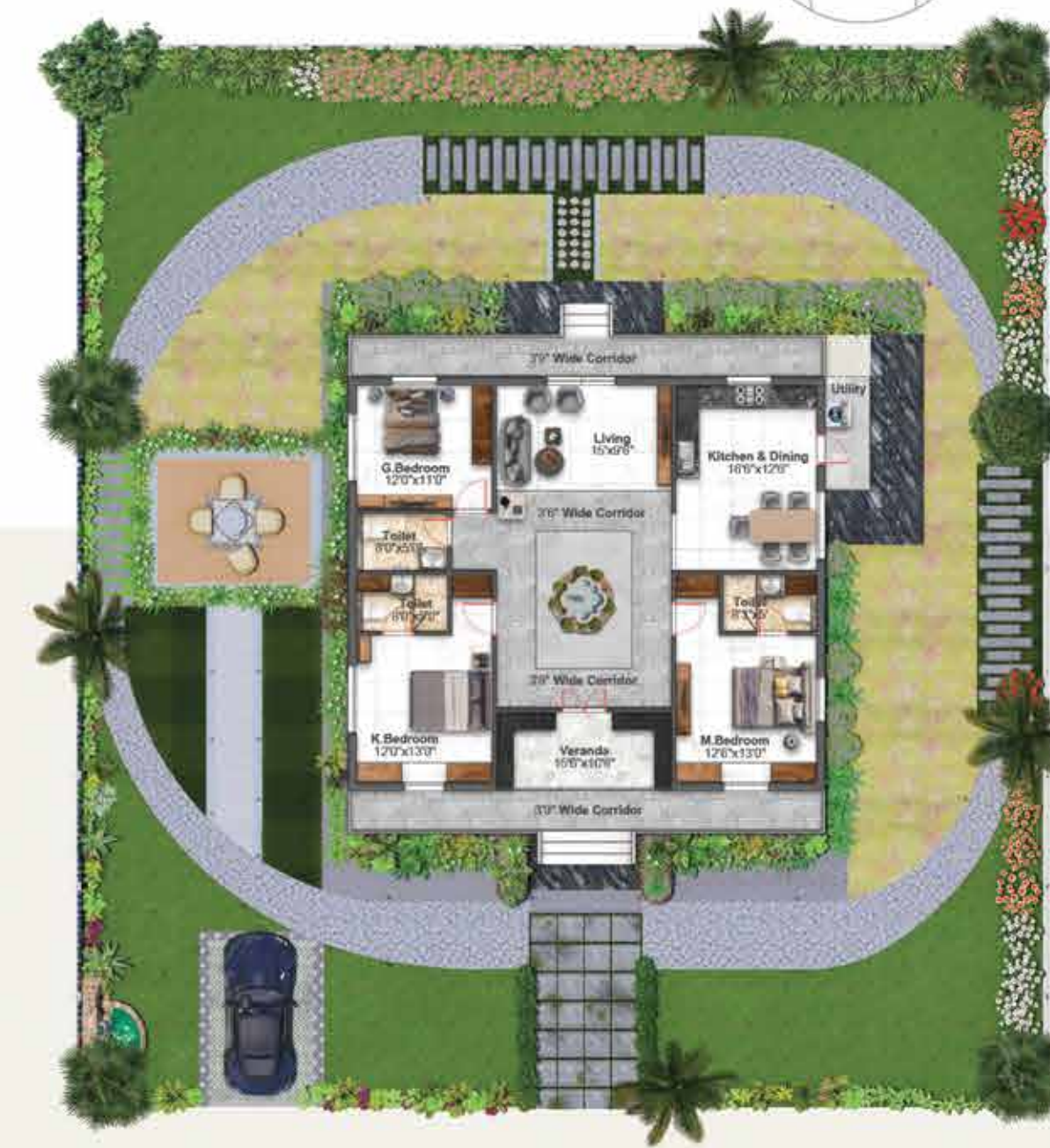
WEST FACING - 3 BHK