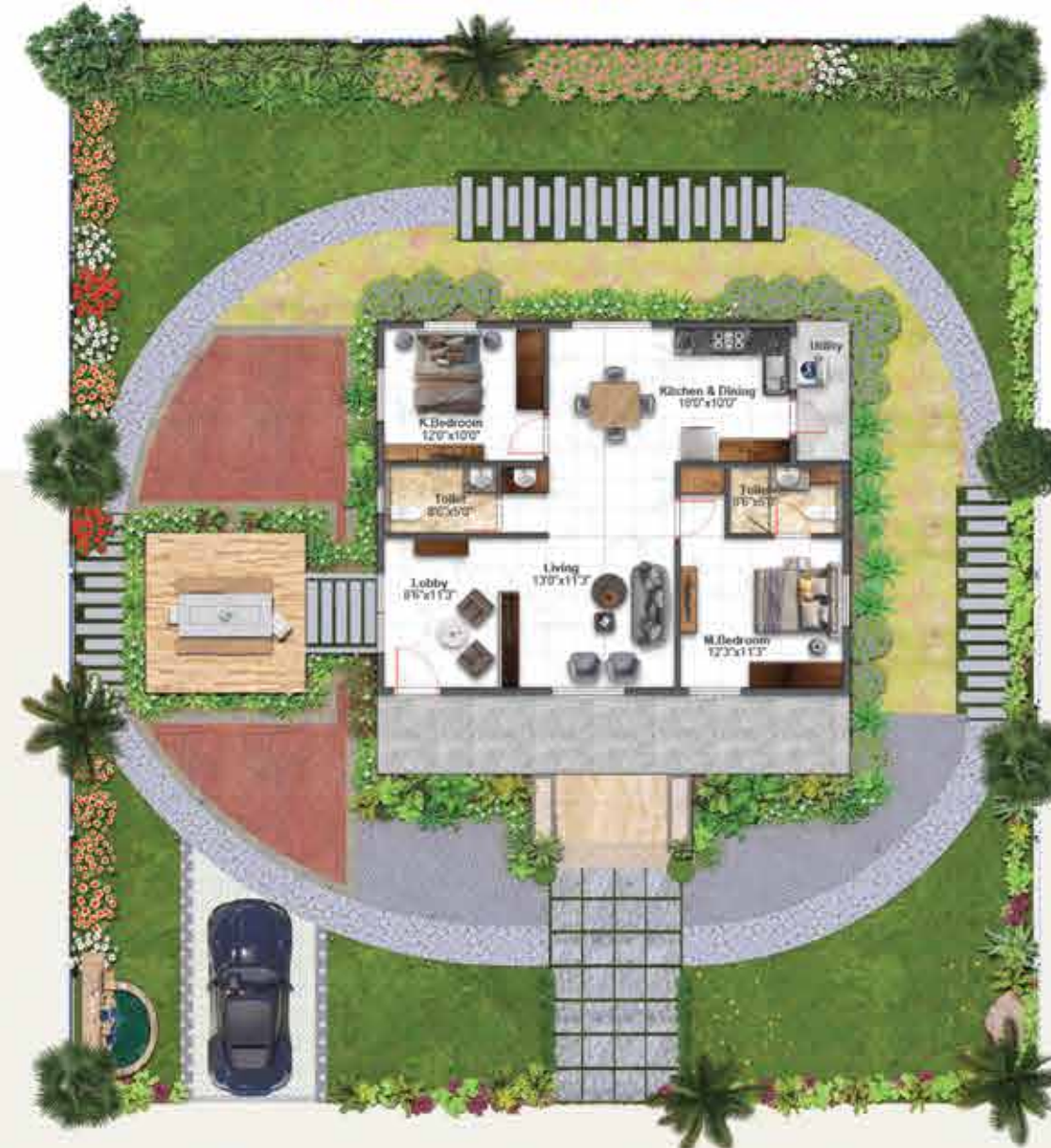
WEST FACING - 2 BHK