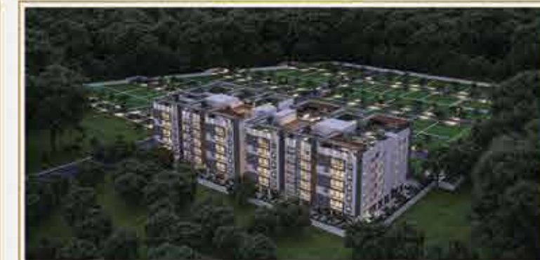
GREEN VALLEY Open Plots @ Kompally