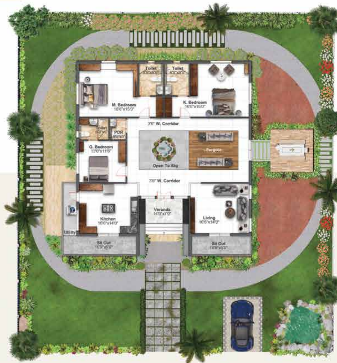
EAST FACING - 3 BHK