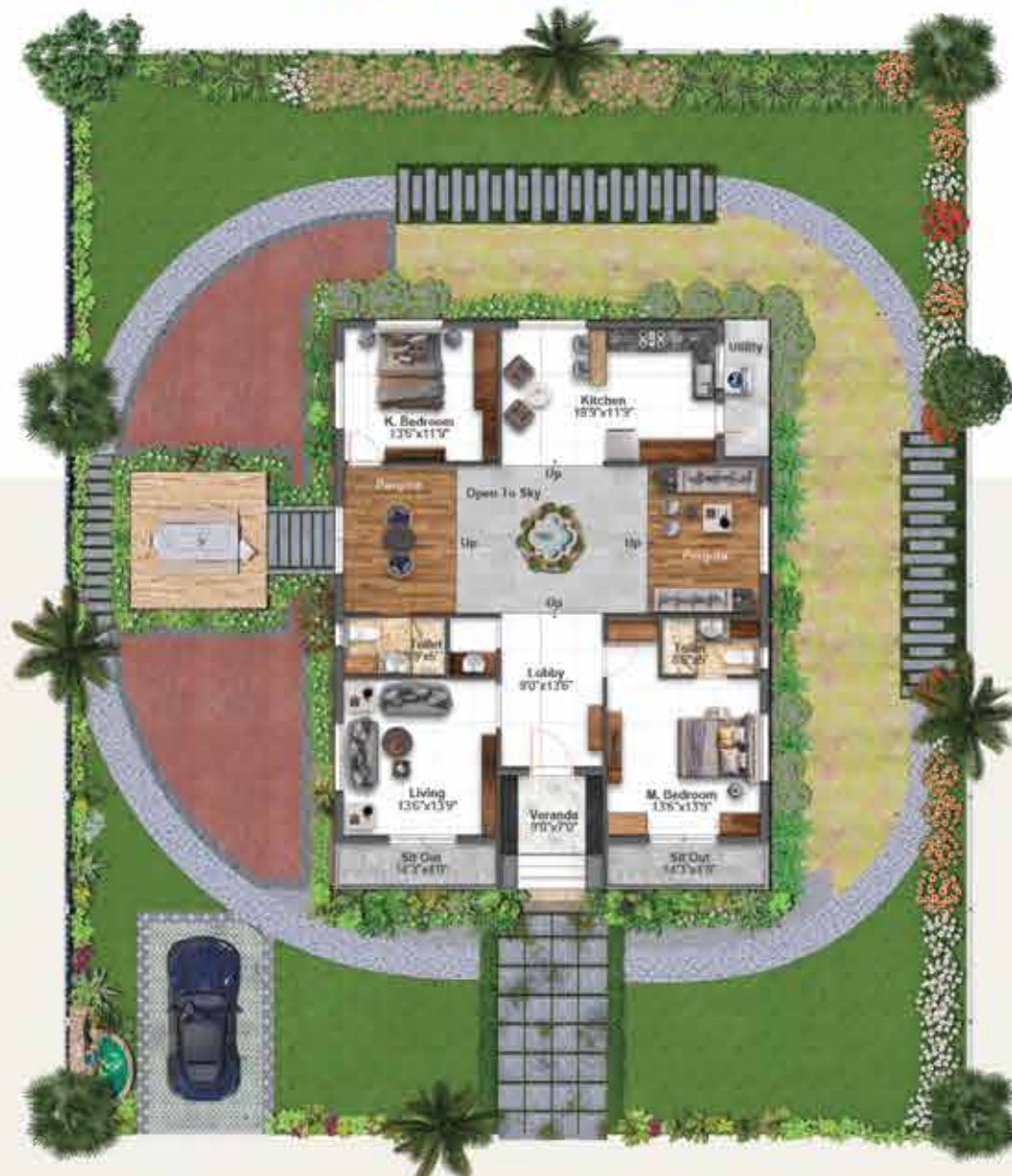
WEST FACING - 2 BHK