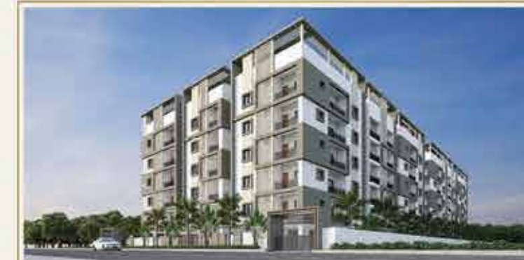
URBAN GREENS 2 & 3 Bedroom Luxury Apartments @ Kompally